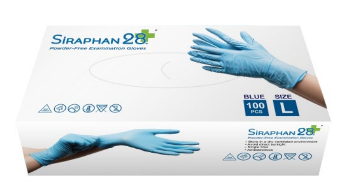
Dimensions: 240mm x 120mm x 70mm