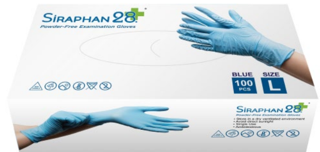
Dimensions: 240mm x 120mm x 70mm

100% latex-free - made from durable nitrile, eliminates the Type I allergic reaction associated with natural rubber